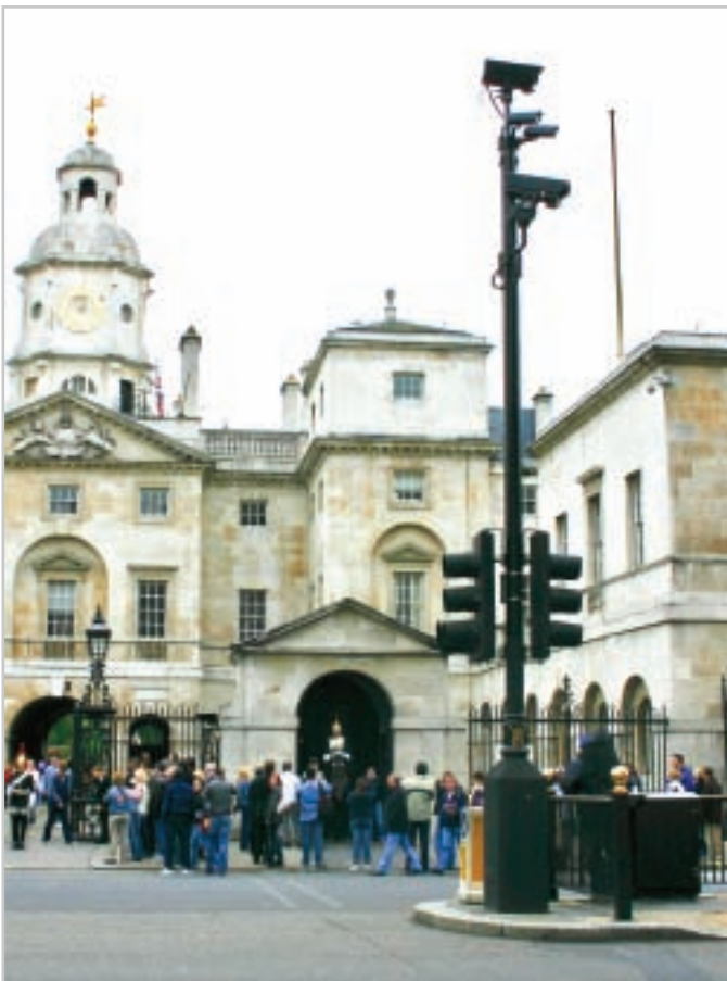
Westminster Pole Horse Guards