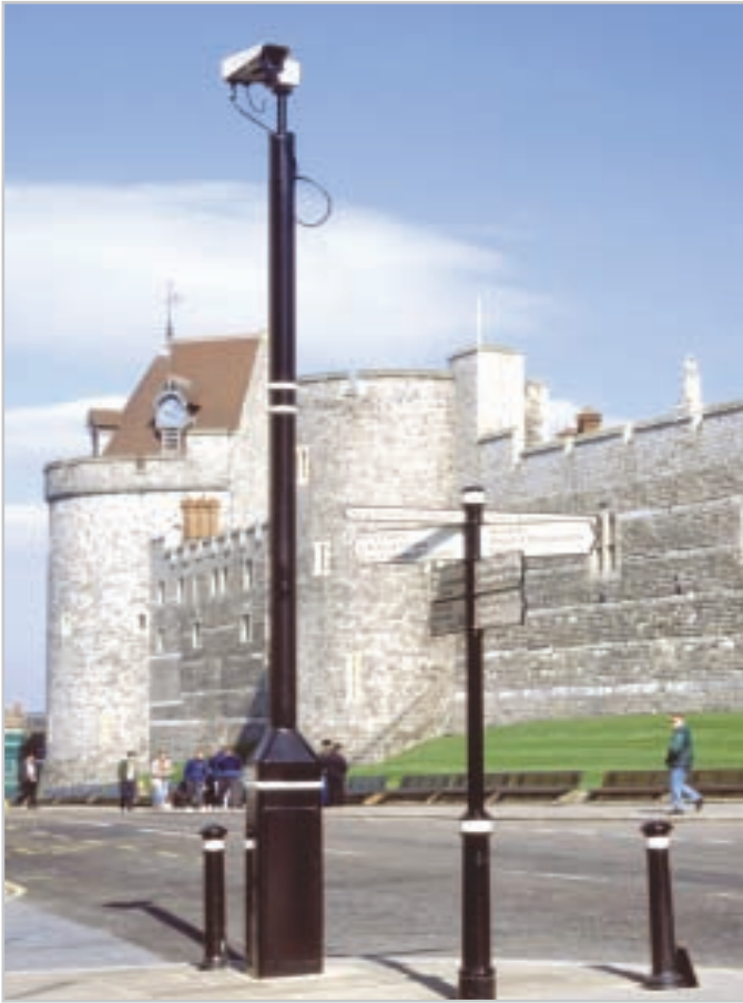
AW 1545 with banding Windsor