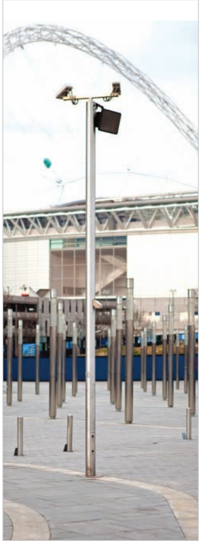
Stainless steel tubular pole Wembley