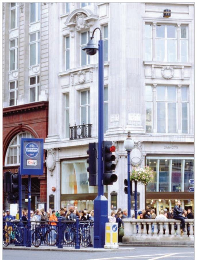
AW 1545UP Oxford Street