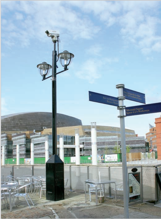
AW 1545 with dual lighting arm