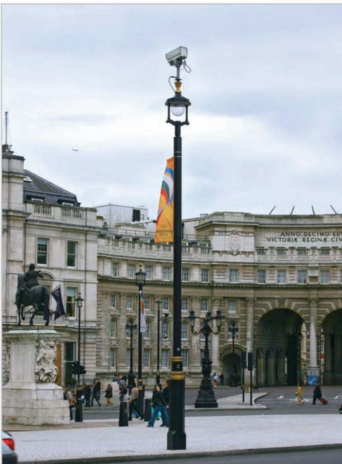
Ornate pole London