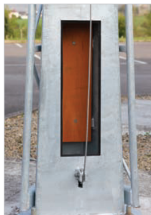
Large equipment mounting backboard