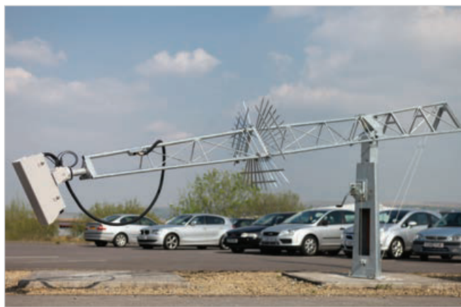
ANCT/6 in tilted position