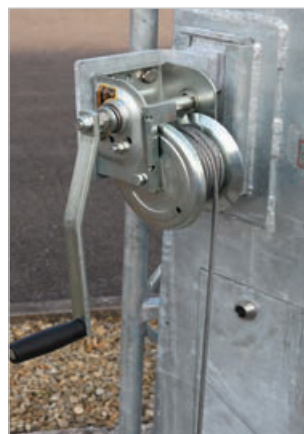
ANCT winch mounting arrangement