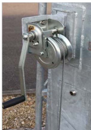
ANCT winch mounting arrangement