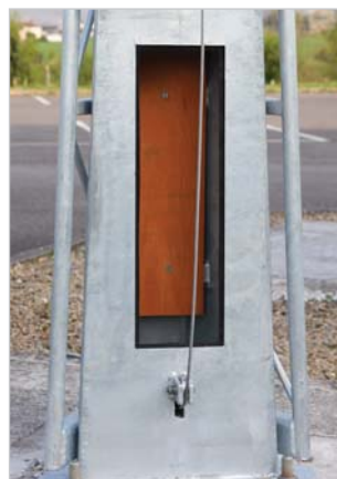
Large equipment mounting backboard