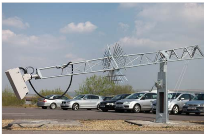
ANCT/6 in tilted position