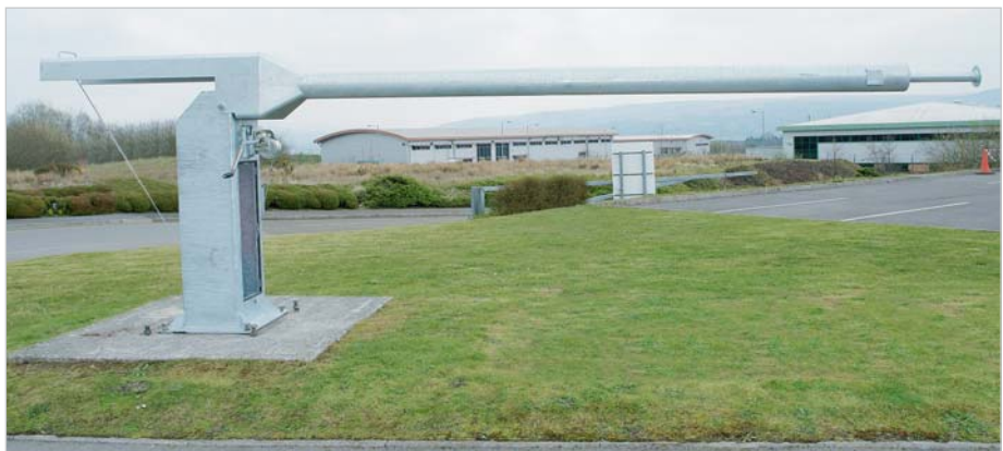
AW1545/6TD/UP in tilted position