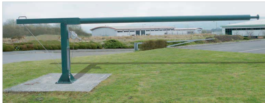
AW1859/6 in tilted position