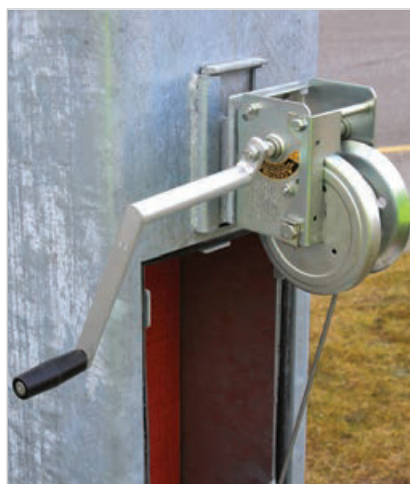
DW1500 Winch mounted on AW1545/TD pole. This bracket type for tubular poles.