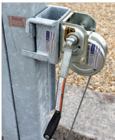
DW1000 Winch mounted on ACC2BPLA column. This bracket type for ACC/ACT columns and towers.

The photographs below show the three sizes of winch that we supply and also the three bracket mounting types.